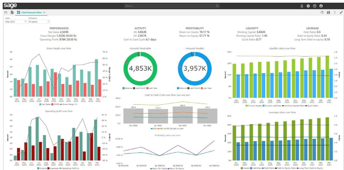
Above: Example of a CFO Dashboard on Sage Data and Analytics

Get actionable data faster, improve data confidence, and reduce IT costs with the powerful, easy-to-use business intelligence toolkit for Sage 100. Sage Data and Analytics gives Sage 100 users a powerful and easy-to-use business intelligence toolkit complete with live dashboards, graphical cashflow analysis and more—right out of the box. To learn more, go to the Sage Data and Analytics page on our Sage Marketplace .